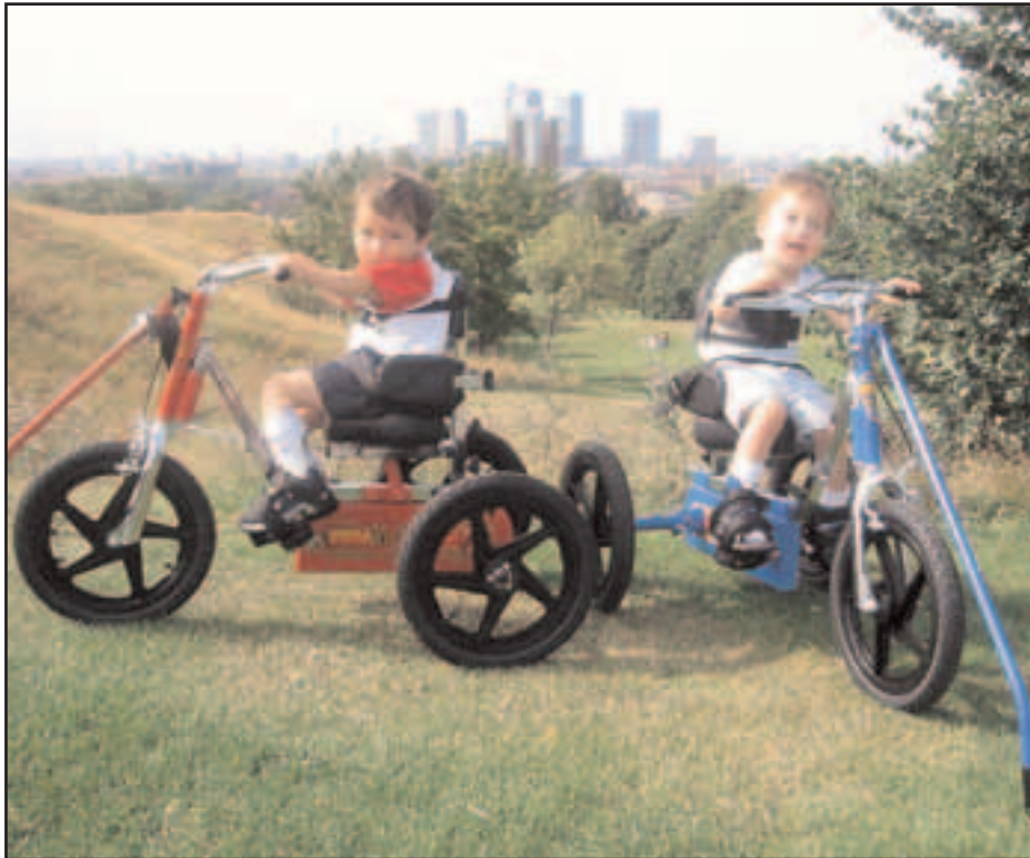
Archie and Charlie in action in the park

Two little boys now have two little bikes - and the wonderful chance of a whole new life, thanks to kind-hearted locals.