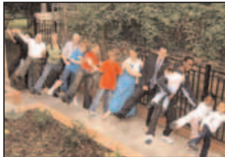
Almost bowled over in the rush as the gates open!

"We're thrilled," she said. "It's always been good having a large open space nearby for sports and other outdoor activities. The new gate gives us a much greater ease of access."